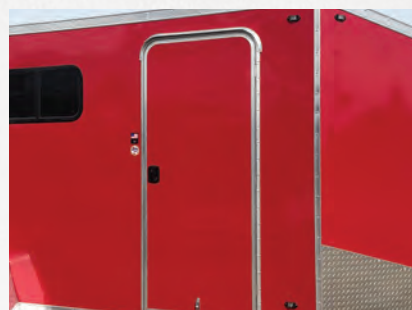
RV Side Door