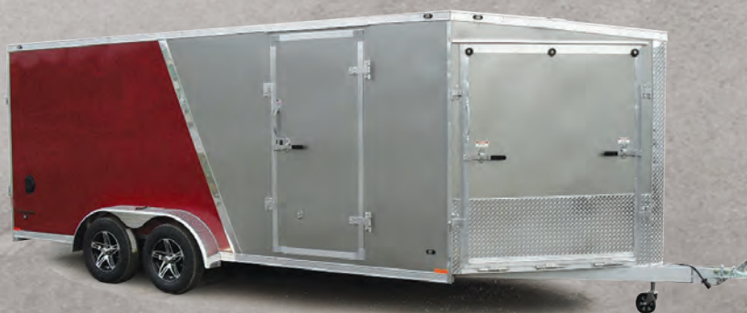
Comanche & Mountaineer - Aluminum Snow Trailers