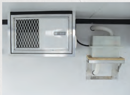
Furnance and A/C Options