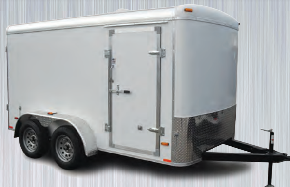
Shown With Optional Round Top No Wedge Package