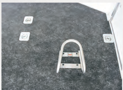
Wheel Chock, D-Rings, Marble Flooring