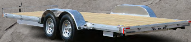
Shadow I - Open Car Haulers