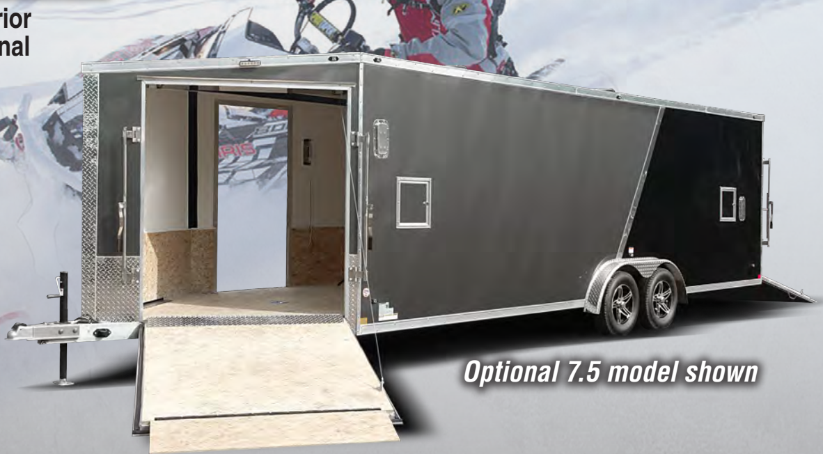
Optional 7.5 model shown