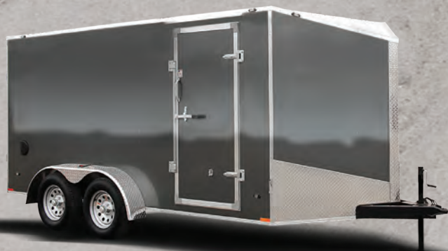
Avenger - Value Cargo Trailers