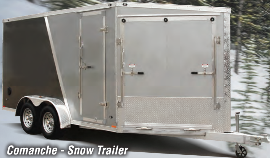
Comanche - Snow Trailer