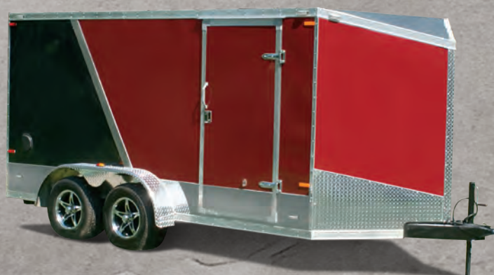
Yukon - Premium Cargo Trailers