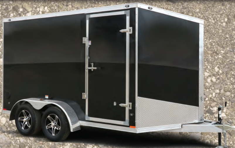
Aerostar 7 Wide