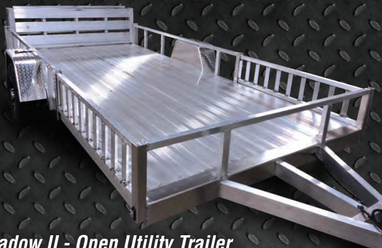
Shadow II - Open Utility Trailer