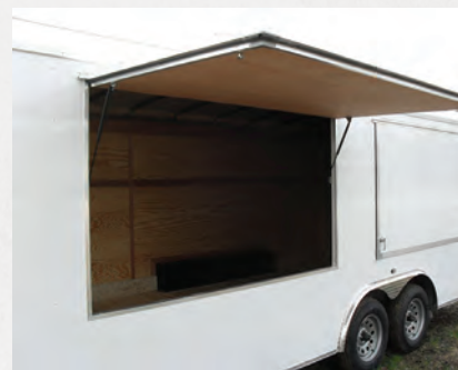
Concession Doors with Gas Props