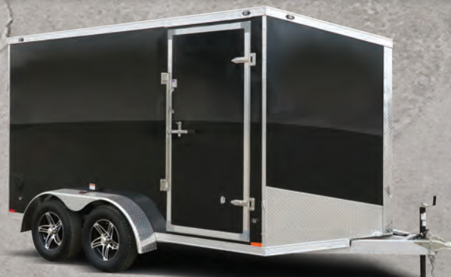
Aerostar - Aluminum Flat Top Slant Wedge