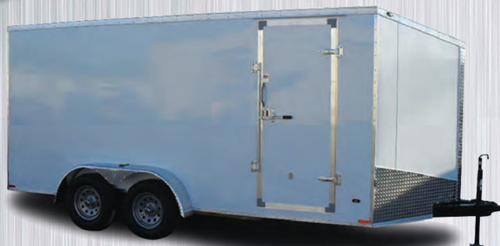
Yukon Shown With Standard Slant Wedge