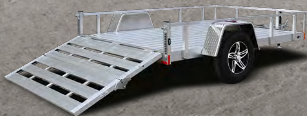
Shadow II- Open Utility Trailers