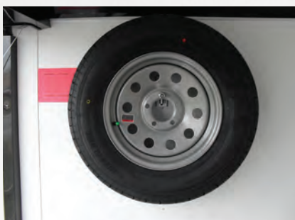
Interior Wall Mount Spare Tire Carrier