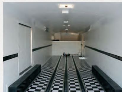
E-Track Floor and Walls