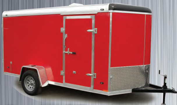
Shown With Optional Round Top Wedge Front Package