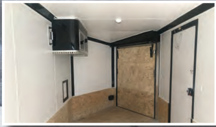
Mountaineer interior shown with optional helmet cabinet