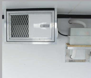
Furnace and A/C Options