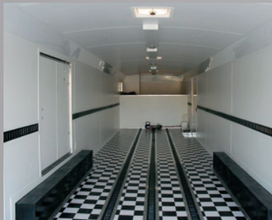
E-Track Floor and Walls