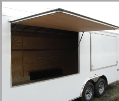
Concession Doors with Gas Struts